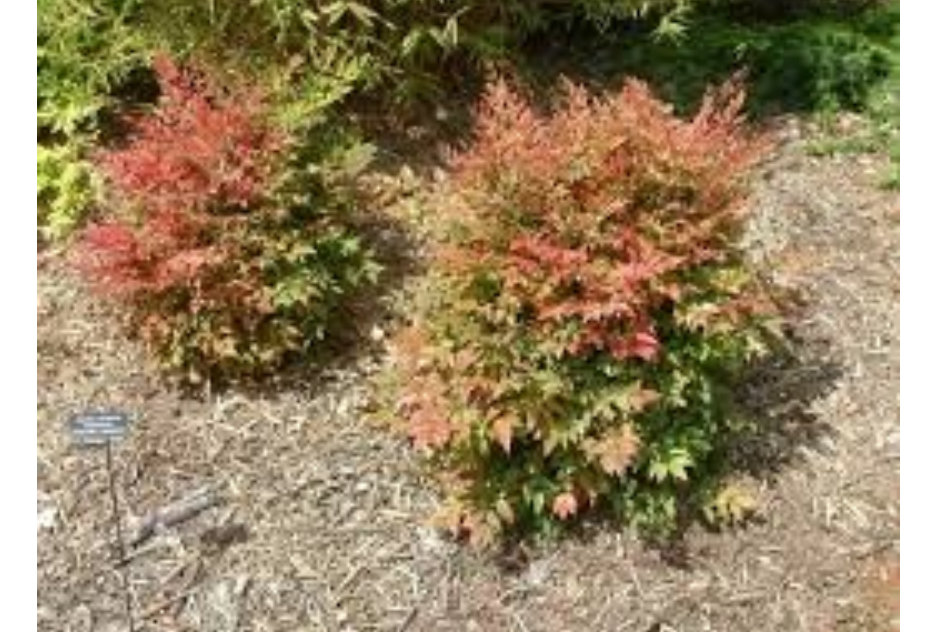
Heavenly Bamboo 💧