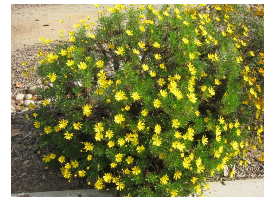
African Shrub Daisy