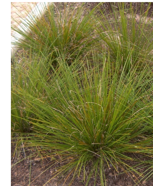
Dwarf Mat Rush 💧