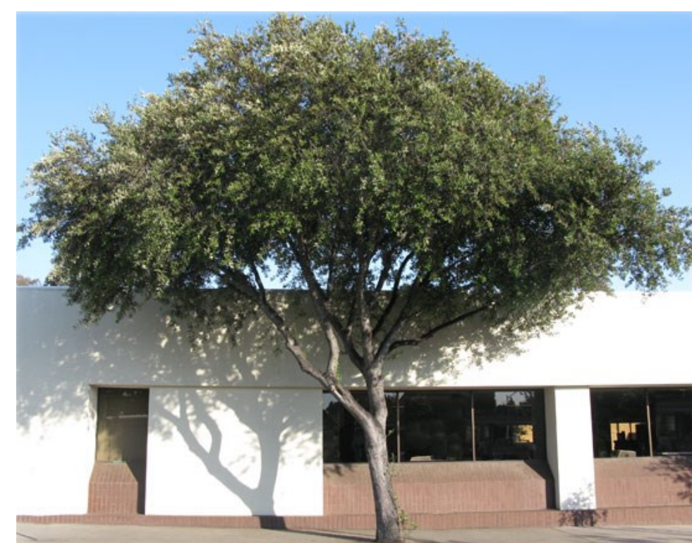
Holly Oak * 🌳