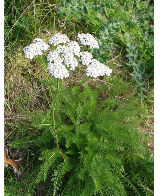
Common Yarrow * 💧