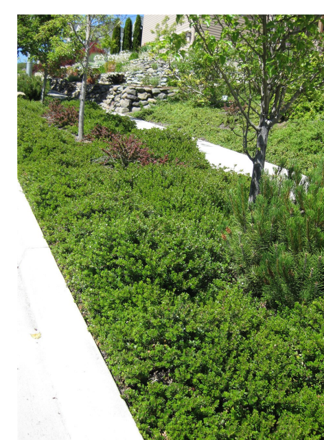
Emerald Carpet Manzanita *