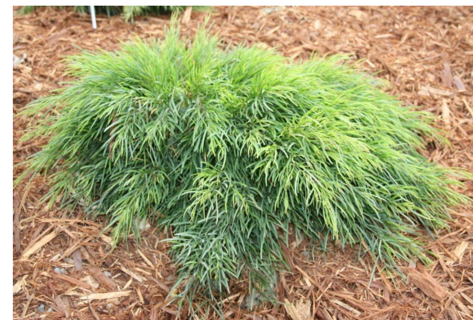
Cousin Itt Little River Wattle

The shrubs and grasses were specially chosen for drought tolerance and their ability to also survive in wet soil. Plants vary from one to four feet tall. Larger plants can be trimmed down if needed. To meet the requirements of the Caltrans Statewide Stormwater Management Permit with the State Water Resources Control Board, a portion of the landscape will be dedicated to treating storm water runoff from the road. This is a low-impact development technique that utilizes local infiltration to improve water quality.