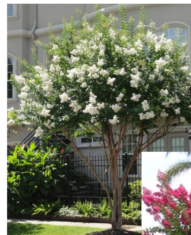
Crape Myrtle 🌳