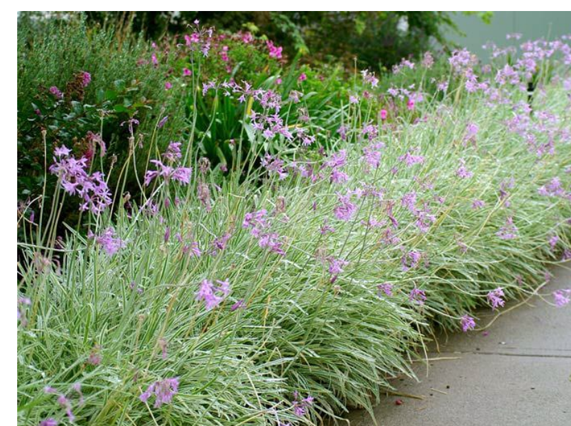
Silverlace Society Garlic