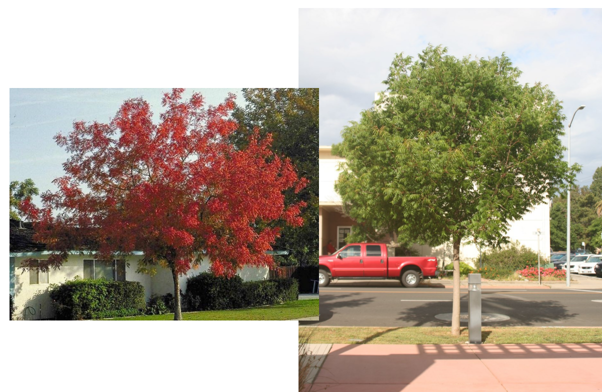
Chinese Pistache 🌳