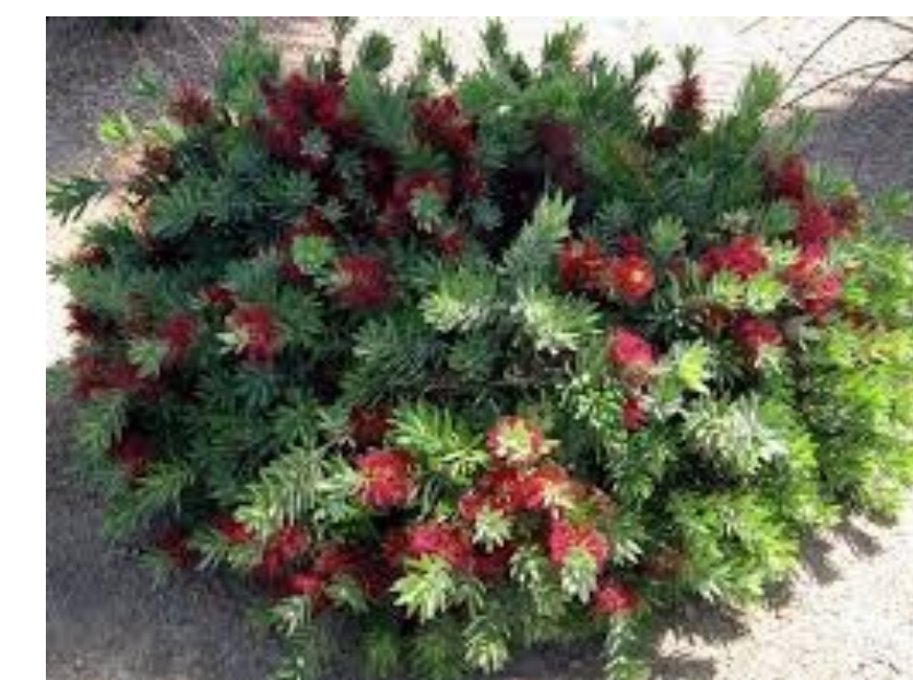
Little John Dwarf Bottlebrush 💧