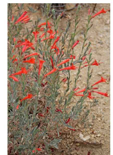
California Fuchsia * 💧