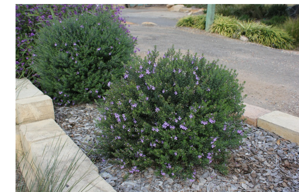
Blue Gem Coast Rosemary