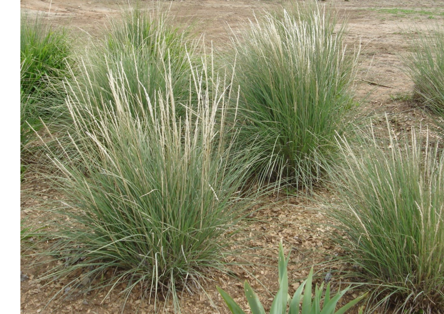
Deer Grass * 💧