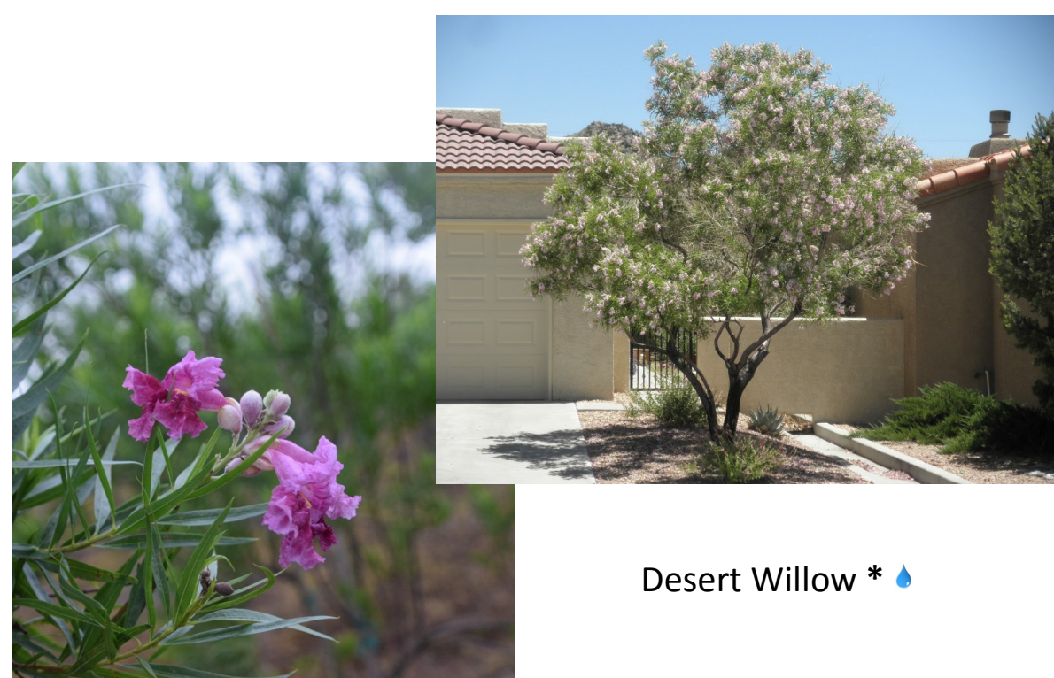
Desert Willow * 💧